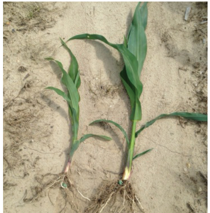
Control field vs. FortiN25 treated corn

Stronger plants equate to better growth potential.