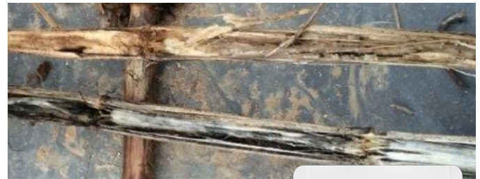
EnduraBreak, 60 days post-harvest